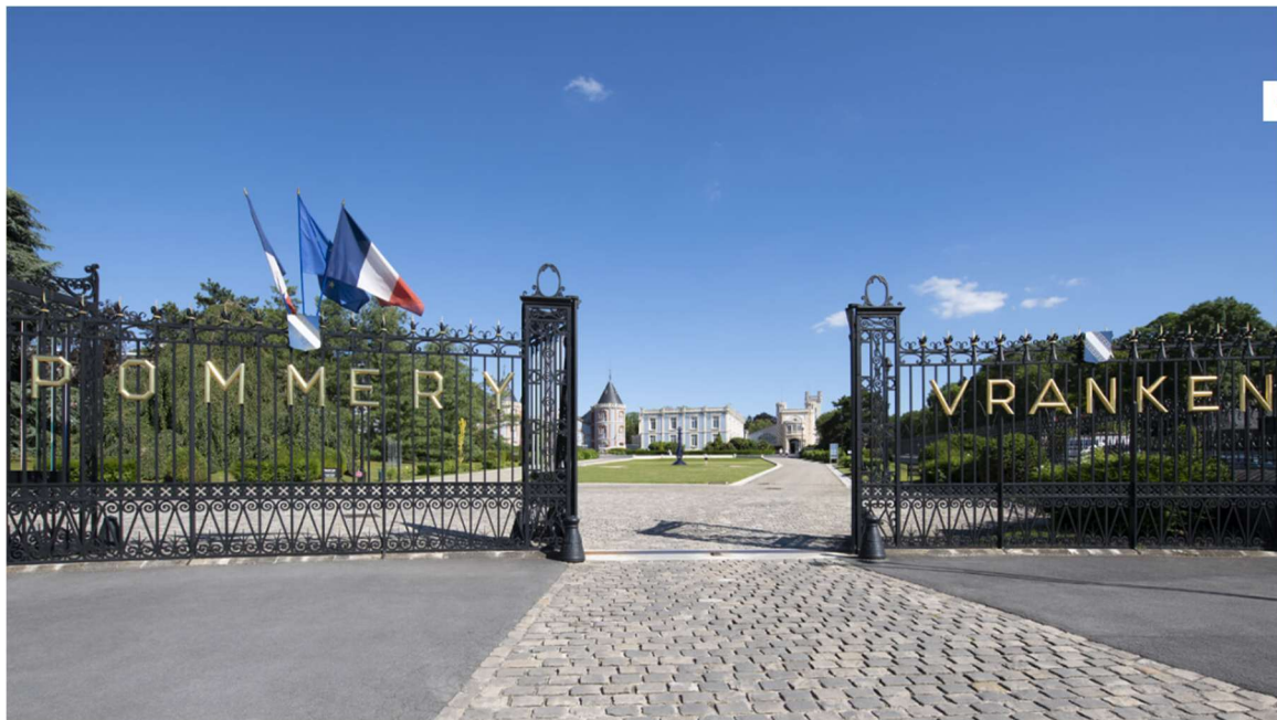
GALA DINER – 'La Maison POMMERY'